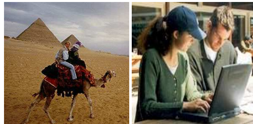
Figure 1: Figure shows two images from Caltech-256 dataset [6]. The images belong to the classes “camel” (L) and “laptop” (R) respectively. Clearly, both the images can also be labeled with the class “people”.

In recent years, a lot of work has been done in the computer vision community towards the development of cross-modal systems. One popular solution is to learn a common latent space by learning modality-specific projections using paired samples across the two modalities, followed by classification/retrieval operation. This latent