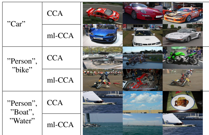
Figure 3: Text queries and top retrieved images obtained using CCA and ml-CCA are shown.

In this section, we compare ml-CCA with other cross-modal approaches which account for label information. Most of the other cross-modal approaches can only handle single label data. Such approaches extract the single label image-text pairs from the multi-label datasets, and show results on this single label subset. Table 3 shows the performance of several such approaches where cross-modal retrieval was performed on the Pascal dataset, using publicly available image and text features provided by [10]. For their inability to account for multi-label data, these approaches use only the single label pairs from the Pascal dataset, resulting in a 2808/2841 train/test split.