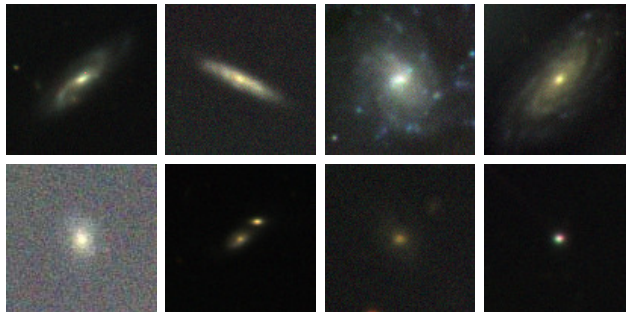
Figure 1. Examples of low-redshift galaxies in our subset of the SDSS dataset. We have mapped the gri -bands to the RGB color space ( gri \rightarrow BGR ). The top row shows well-resolved galaxies and the bottom row shows problematic cases for our analysis. These color images are best viewed electronically.

There has been some prior work on automated analysis of optical images of galaxies [14, 9]. Much of this work, however, focuses on classification of galaxies based on morphology (e.g. [4]) and tends to ignore information found in the texture. Furthermore, these approaches have used somewhat standard image features as input. Here we present new