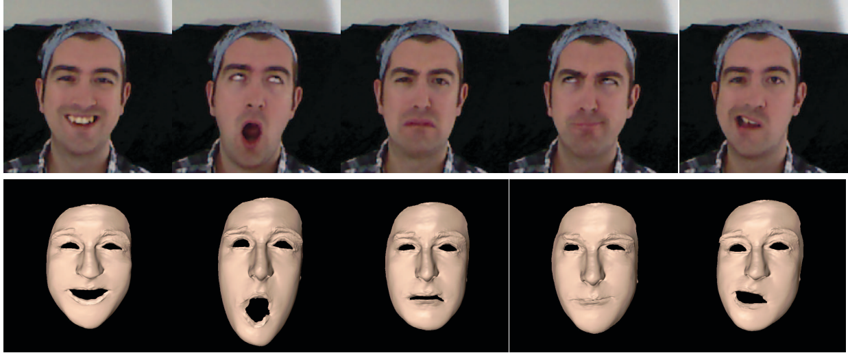
Figure 1. Accurate and robust facial performance capture using a single Kinect : (top) reference image data; (bottom) the reconstructed facial performances.

ture [9], which can robustly and accurately track a sparse set of markers attached on the face. Recent effort in this area (e.g., [2, 10]) has been focused on complementing marker-based systems with other capturing types of devices such as video cameras and/or 3D scanners to improve the resolution and details of captured facial geometry. Marker-based motion capture, however, is not practical for random users targeted by this paper as they are expensive and cumbersome for 3D facial performance capture.