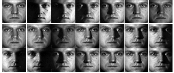
Figure 2: Samples from the CMU PIE database with different illumination conditions. The first image in the upper left is the frontal face picture used for training and the rest are assigned for testing.

As can be seen, the obtained deep representation using the VGG-Face is robust against illumination variations. However, the obtained accuracies are slightly lower compared to the results achieved by the state-of-the-art illumination-robust face recognition approaches [15, 41, 33]. These results indicate that the performance of deep