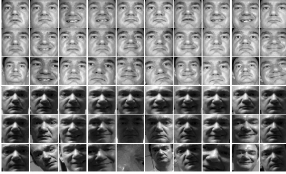
Figure 5: Samples from the FRGC database aligned with different registration errors. The first three rows are acquired from FRGC1 and show the training samples (row1) and testing samples aligned with zero (row2) and 10% (row3) registration errors, respectively. The second three rows are associated with FRGC4 and depict the training samples (row4) and testing samples aligned with zero (row5) and 20% (row6) registration errors, respectively.

handle pose variations of up to 67.5 degrees. Nevertheless, the results can be further improved by employing pose normalization approaches, which have been already found useful for face recognition [5, 2, 8]. The performance drops significantly when the system is tested with profile images. Besides the fact that frontal-to-profile face matching is a challenging problem, the lack of enough profile images in the training datasets of deep CNN face models could be reason behind this performance degradation.