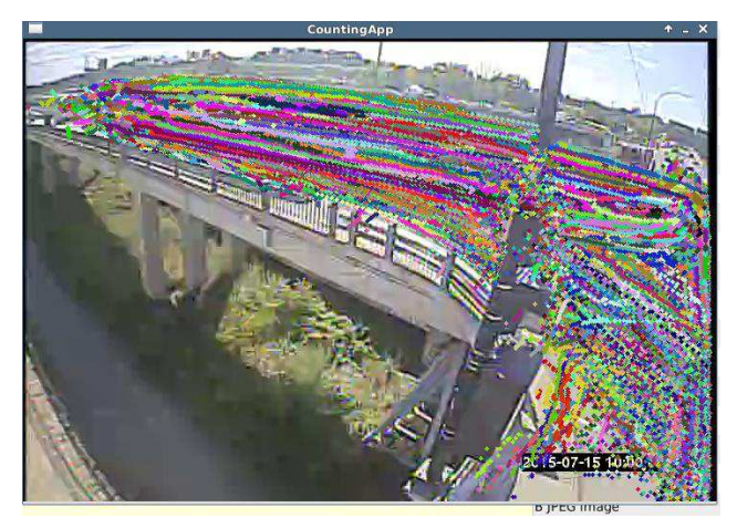
Figure 6. Trajectory fragmentation because of street furniture (site 030)

counts for the same vehicle. In an intersection, this fact can be compensated in the CountingApp by using an elimination strategy, keeping only the trajectories that are directly inside of the intersection (specifically: in movement between the stop bars). That being said, because of certain lane configuration and site-specific realities, certain movements are only tracked when leaving the intersection and are always fragmented.