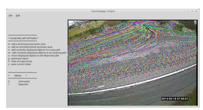
Figure 1. The CountingApp start-up screen showing all trajectories on a video frame background

The CountingApp outputs a report with a count for every user-defined path and for every time interval (of user-defined duration). Most of the analysis is achieved through a graphical user interface, presented here in Figure 1. The application window is divided in two parts. The left part is a standard command list, allowing for textual inputs and outputs. The right part consists of a single video frame for positional inputs and outputs. All vehicle positions are displayed on the video frame at start-up. All positions corresponding to the same vehicle i are displayed with the same color, making a complete trajectory T_i .