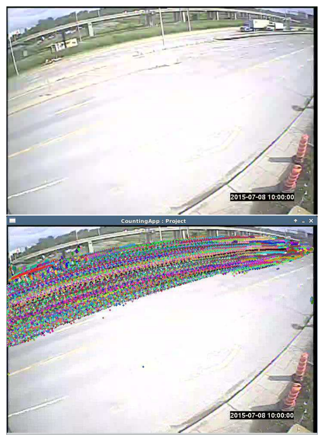
Figure 9. Top: Views of site 032 with, in order from bottom to top, two eastbound lanes, two westbound lanes, one westbound highway entry lane and two westbound highway lanes. Bottom: Westbound highway and entry lanes trajectories.