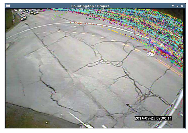
Figure 8. Trajectory overlap between overlapping movements in shared lanes (site 026)