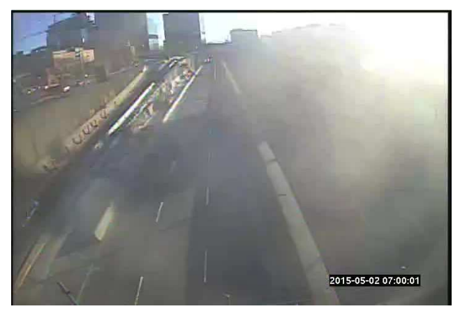
Figure 5. Back lighting effect that limits the counting performance (site 029)

Figure 5 is an example of a problematic site. There is back lighting at this particular time and the zone of interest for counting is to the right of the concrete divide, which is invisible in this image.