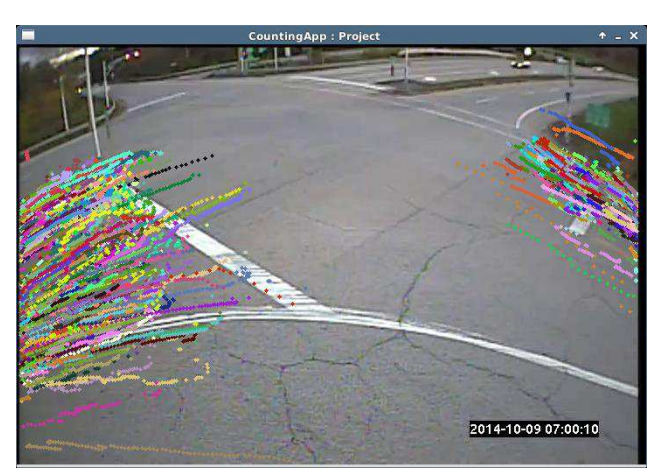
Figure 7. Trajectory fragmentation because of stop-and-go motion of vehicles at the approach of a stop sign (site 028)