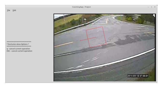
Figure 2. An exclusion box defined by the user

Excluding trajectories is achieved by either an exclusion box or a directional exclusion box, defined by the user on the screen. Any number of exclusion boxes can be used. All trajectories crossing an exclusion box will be removed from the display. A directional exclusion box (see Figure 2) is similar to an exclusion box, but with an added directional vector \vec{d} of unit length. All trajectories crossing the box are removed from display if \vec{t} \cdot \vec{d} > \cos \theta , where \vec{t} is a unit vector obtained through a linear regression of n points of the trajectory in the area of the box, and \theta is the maximum angle accepted between \vec{t} and \vec{d} .