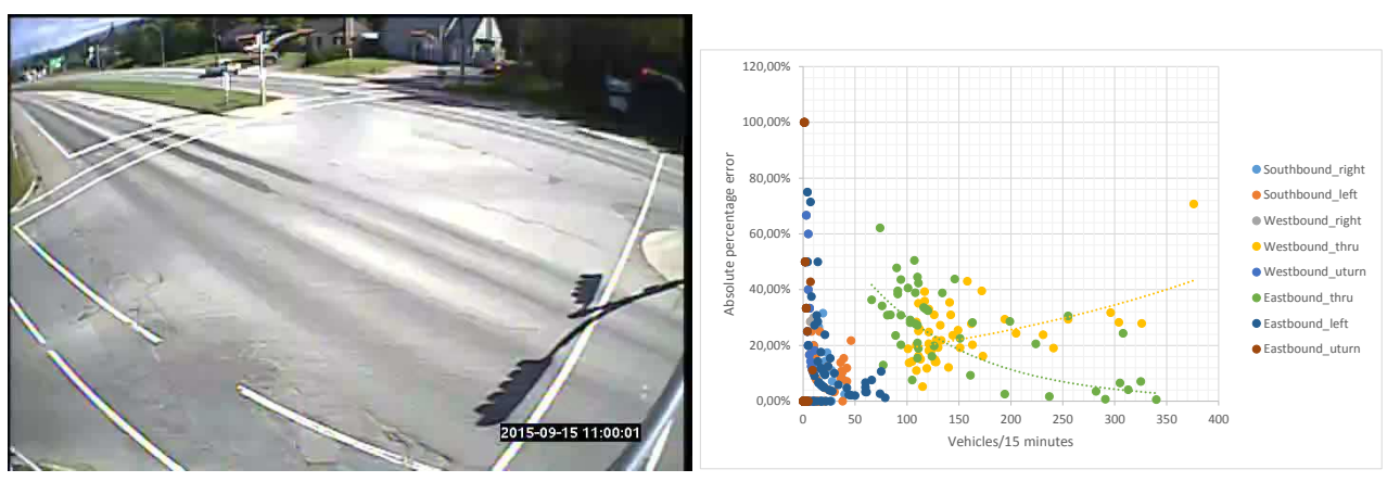
Figure 4. Absolute percentage error for each movement and 15-min interval as a function of flow for site 060 (intersection), shown on the

Figure 5 is an example of a problematic site. There is back lighting at this particular time and the zone of interest for counting is to the right of the concrete divide, which is invisible in this image.