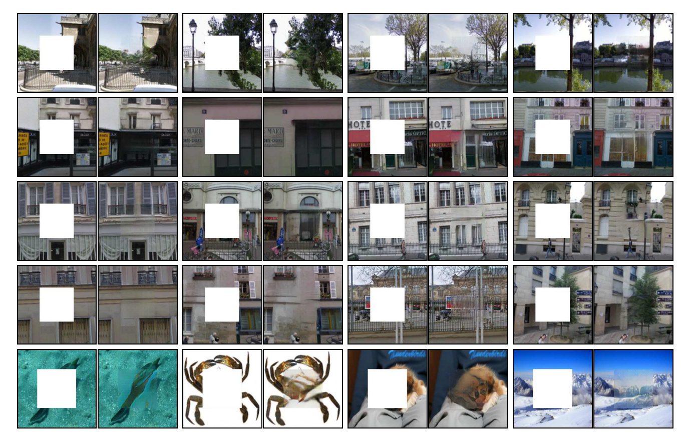
Figure 4: Semantic Inpainting results for context encoder trained jointly using reconstruction and adversarial loss. First four rows contain examples from Paris StreetView Dataset, and bottom row contains examples from ImageNet.