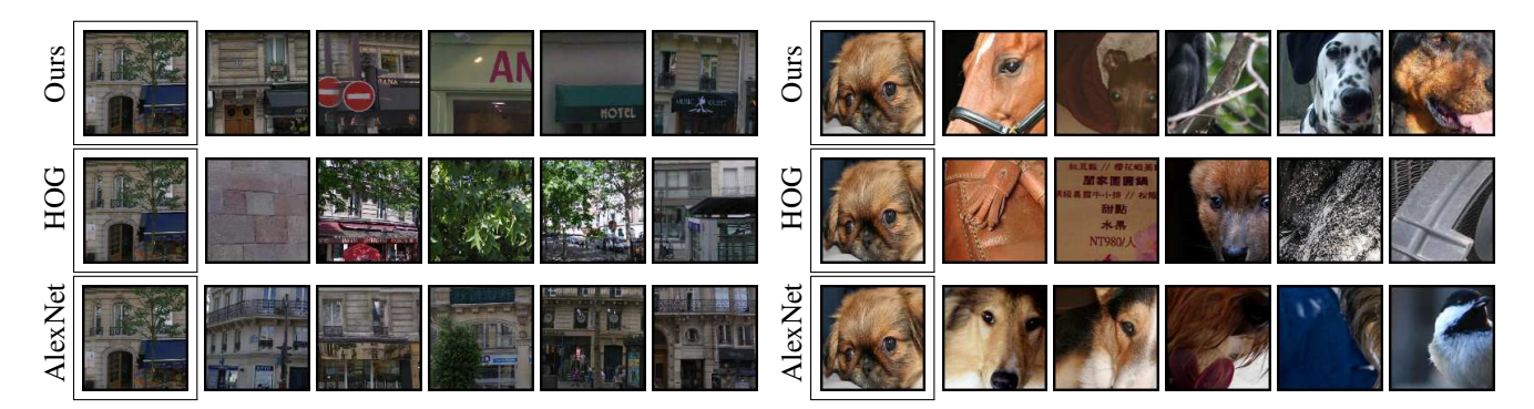
Figure 8: Context Nearest Neighbors. Center patches whose context (not shown here) are close in the embedding space of different methods (namely our context encoder, HOG and AlexNet). Note that the appearance of these center patches themselves was never seen by these methods. But our method brings them close just from their context.