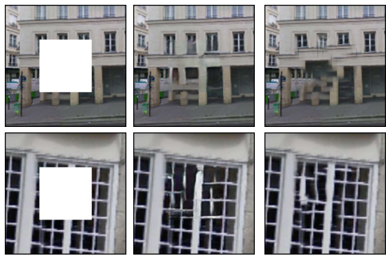
Figure 5: Comparison with Content-Aware Fill (Photoshop feature based on [2]). Our method works better in semantic cases (top row) and works slightly worse in textured settings (bottom row).

Random block To prevent the network from latching on the the constant boundary of the masked region, we randomize the masking process. Instead of choosing a single large mask at a fixed location, we remove a number of smaller possibly overlapping masks, covering up to \frac{1}{4} of the image. An example of this is shown in Figure 3b. However, the random block masking still has sharp boundaries convolutional features could latch onto.