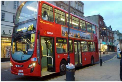
COCO-QA: What does the red, two level bus with its doors open on the street and passengers inside the bus? Ground Truth: Doors Predicted: Bus