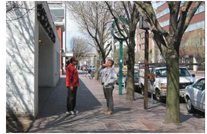
Visual7W: 2. What color is the sidewalk? Ground Truth: Gray Predicted: Gray Visual7W: 1. Where are the men talking? GT: Sidewalk Predicted: In the street