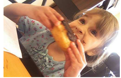
COCO-QA: What does the small child eat at the table? Ground Truth: Donut Predicted: Donut