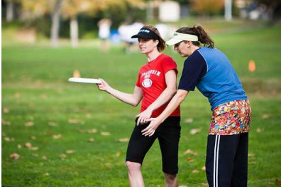
COCO-VQA: What are they playing? Ground Truth: N/A Predicted: Frisbee