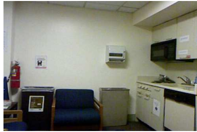
DAQUAR: What is on the left side of the fire extinguisher and on the right side of the chair? Ground Truth: Table Predicted: Table