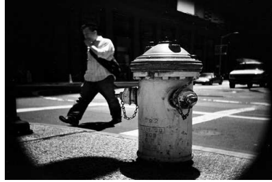
COCO-VQA: What kind of lens is used in this photo? Ground Truth: N/A Predicted: Fire Hydrant