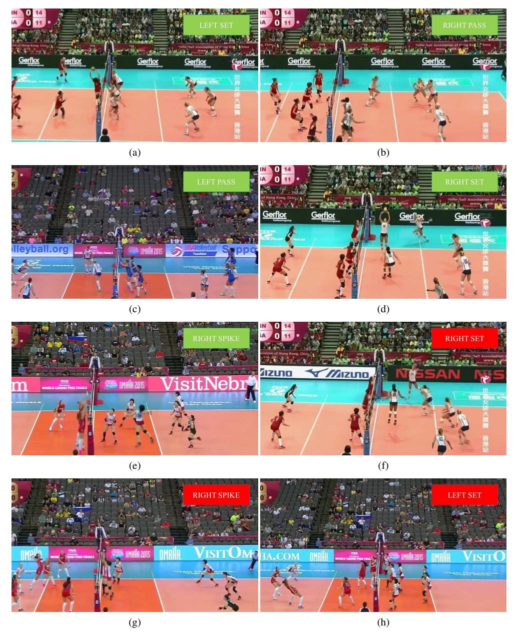
Figure 4: Visualizations of the generated scene labels using our model. Green denotes correct classifications, red denotes incorrect. The incorrect ones correspond to the confusion between different actions in ambiguous cases (h and j examples), or in the left and right distinction (i example).

From the tables, we observe that the group activity labels are relatively more balanced compared to the player action labels. This follows from the fact that we often have people present in static actions like standing compared to dynamic actions (setting, spiking, etc.). Therefore, our dataset presents a challenging team activity recognition task, where we have interesting actions that can directly determine the group activity occur rarely in our dataset. The dataset will