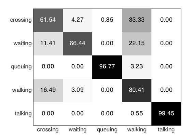
Figure 3: Confusion matrix for the Collective Activity Dataset obtained using our two-stage model.

It is clear that our two-stage model has improved performance with compared to baselines. The temporal information improves performance. Further, finding and describing the elements of a video (i.e. persons) provides benefits over utilizing frame level features.