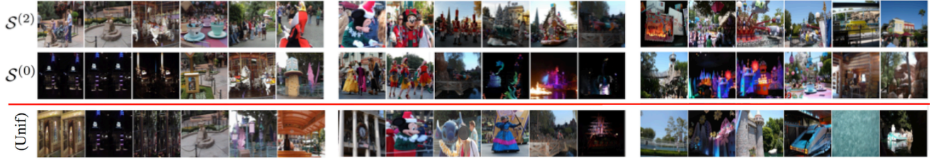
Figure 4. Qualitative comparison of photo stream summarization. We show the top six images of the summaries created by our method (at initialization and after 2 iterations) and the baseline ( Unif ). The results become more semantically meaningful after the two iterations.