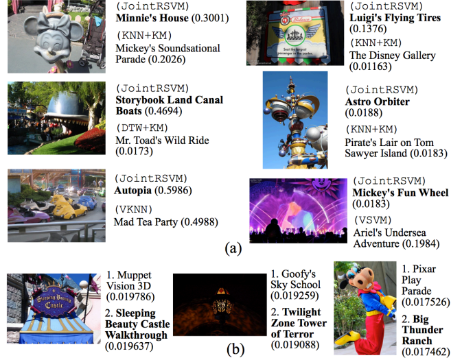
Figure 2. Examples of localization. (a) Comparison of results between our method and the best baseline in each case, with confidence values. (b) Typical near-miss failures. The correct answers (in bold font) are estimated as the second best ones. From left to right: (i) similar appearance of attractions, (ii) too dark images, and (iii) characters only weakly associated with location.

As location classes, we use 108 selected attractions and restaurants from 18 districts of the two Disney parks: Disney California Adventure and Disneyland park . We find the list of attractions from visitors' map. In supplementary we describe details of how we apply our method and baselines.