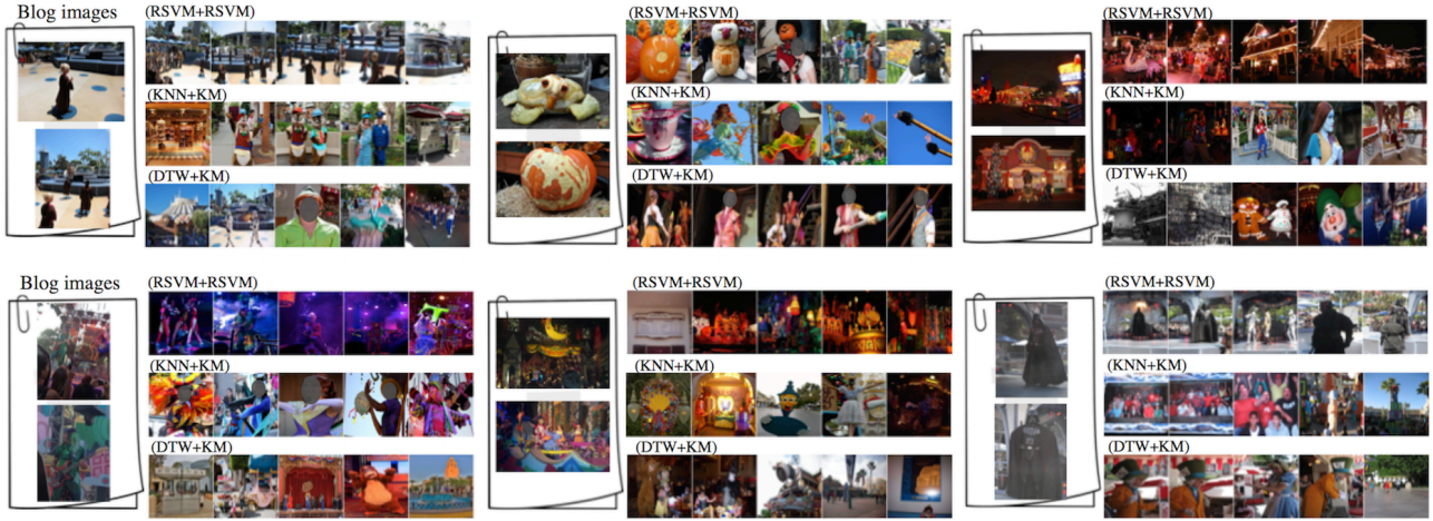
Figure 5. Examples of the interpolations between blog images. The left pair of images illustrates consecutive blog query images, and the right photo sequences are the interpolation results by different algorithms.

consecutive images in the blogs as a test set denoted by (I_q^1, I_q^2) \in \mathcal{I}_Q . We run our algorithm and baselines to generate the most probable sequence of images between I_q^1 and I_q^2 . On AMT we show I_q^1 and I_q^2 and then a pair of image sequences predicted by our method and one of the baselines. We ask a turkers to choose the most likely result. We obtain answers from five turkers for each query pair (I_q^1, I_q^2) .