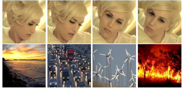
Figure 2: Examples of YouTube celebrity and UPENN datasets.

The recognition accuracies for all the studied methods