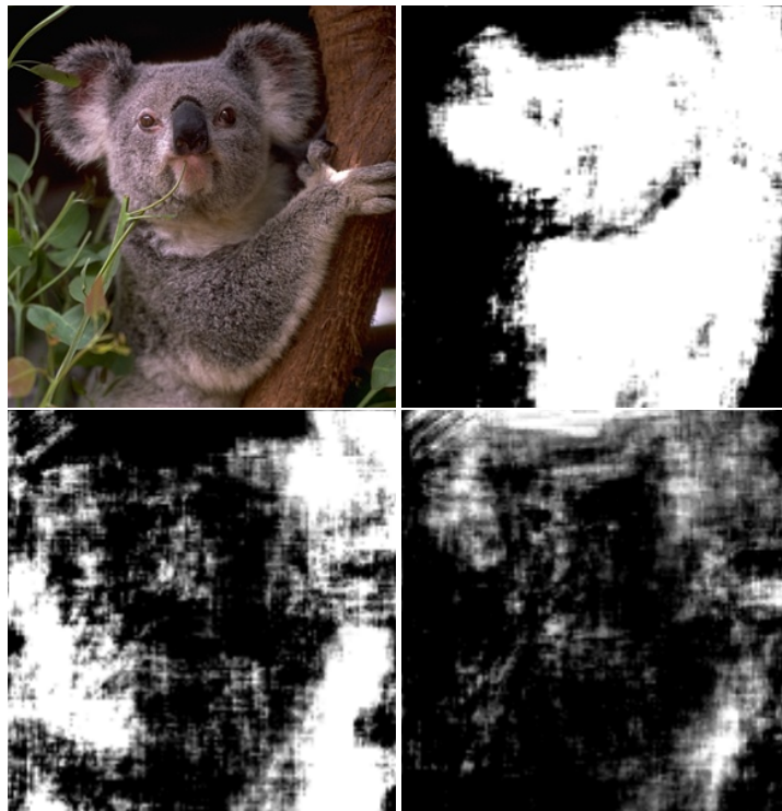
Figure 1: Predicted probabilities for three discovered attributes. Discovered attributes exhibit the desired properties of material traits despite the fact that we only rely on local, weakly-supervised information.

Figure 1 shows an example of three discovered attributes. We visualize the attributes on a sample image by predicting their per-pixel probabilities. We can clearly see that the attributes highlight distinct image regions. Figure 2 demonstrates that we do indeed discover an attribute space that separates material categories. Quantitatively, we verify that our discovered