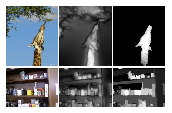
Figure 1: Pixel-precise (middle) and segment-based (right) saliency maps of our VOCUS2 saliency system

Abstract: We show in this paper that the seminal, biologically-inspired saliency model by Itti et al. [3] is still competitive with current state-of-the-art methods for salient object segmentation if some important adaptions are made. We show which changes are necessary to achieve high performance, with special emphasis on the scale-space: we introduce a twin pyramid for computing Difference-of-Gaussians, which enables a flexible center-surround ratio. The resulting system, called VOCUS2, is elegant and coherent in structure, fast, and computes saliency at the pixel level. Some example saliency maps are shown in Fig. 1.