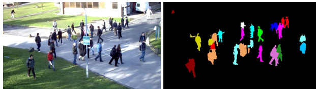
Figure 1: An example of our instance-based segmentation.

We argue that it is beneficial to consider all image evidence to handle tracking in crowded scenarios. In contrast to many previous approaches, we aim to assign a unique