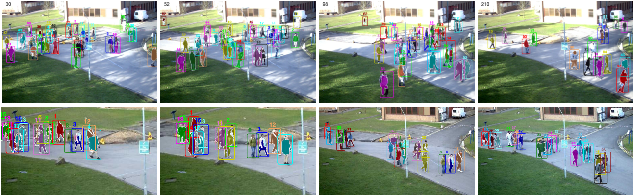
Figure 4: Qualitative tracking and segmentation results on the sequences S2L2 ( top ) and S1L1-2 ( bottom ).