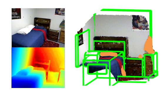
Figure 1: With a given RGBD image ( left column ), our method explores the 3D structures in an indoor scene and estimates their geometry using cuboids ( right image ). It also identifies cluttered/unorganized regions in a scene ( shown in orange ) which can be of interest for tasks such as robot grasping.

This is an extended abstract. The full paper is available at the CVF webpage.