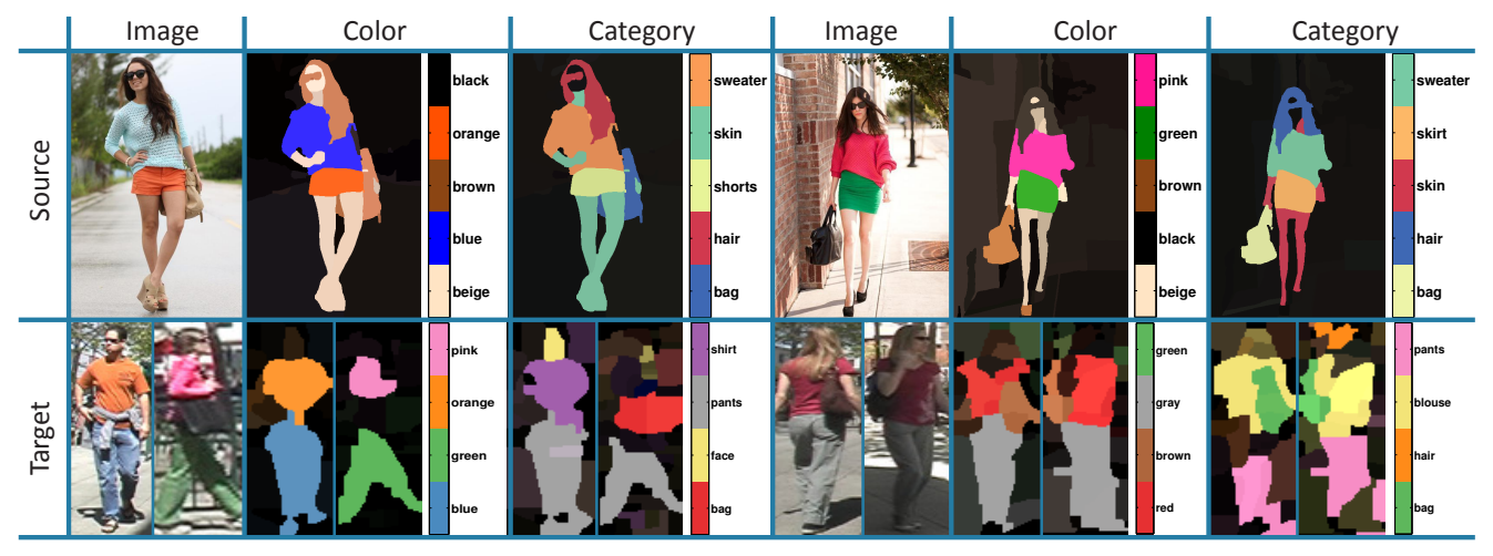
Figure 2: Visualisation of our model output. Each patch is colour-coded to show the inferred dominant attribute of two types.

in the two auxiliary datasets are combined synergistically, and weakly-annotated data can be used effectively (f-F+w-C > f-F); and (ii) while capable of exploiting strong supervision where available, our framework does not critically rely on it (w-F+w-C close to f-F+w-C; w-F close to f-F).