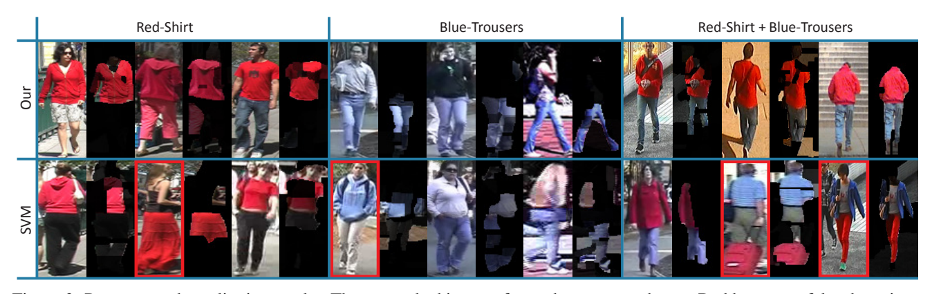
Figure 3: Person search qualitative results. The top ranked images for each query are shown. Red boxes are false detections.