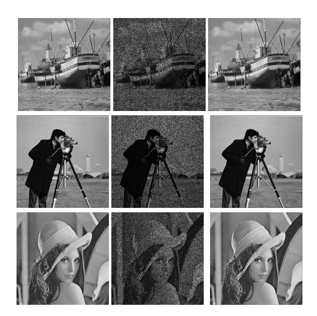
Figure 2. Image noise removal using the spectral k-support norm and the nuclear norm. Left: Original image. Middle: Noisy image. Right: Recovered image using the spectral k-support norm.