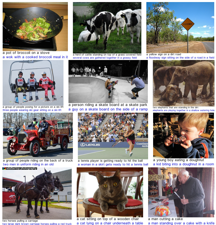
Figure 2: Qualitative results for several randomly chosen images on the MS COCO dataset, with our generated caption (black) and a human caption (blue) for each image. Top rows also show MIL based localization. More examples can be found on the project website: http://research.microsoft.com/image_captioning .