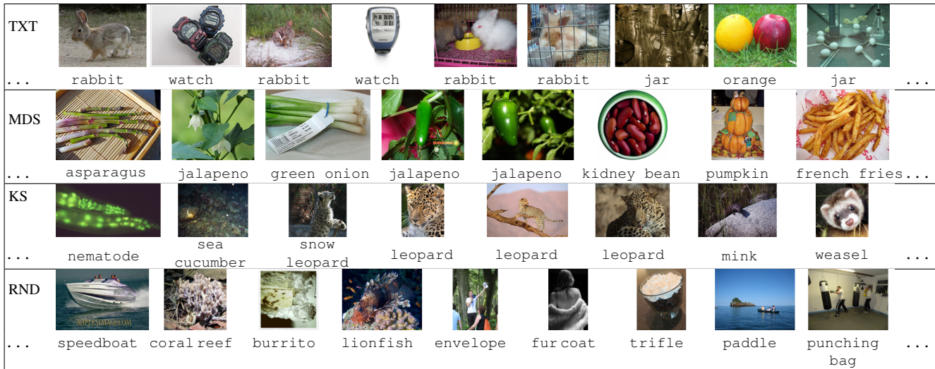
Figure 4. Excerpts of label sequences and test images for TXT, MDS, KS and RND method.

parameter \frac{1}{\lambda} , where \lambda is the probability of starting a new segment at any step. We denote the mechanism of generating sequences in this way by \text{MDS}(\lambda) and \text{KS}(\lambda) .