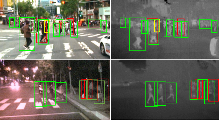
Figure 1: Examples of proposed multispectral pedestrian dataset . It consists of aligned color-thermal image pairs for day and night traffic scenes. The annotations provided with the dataset such as green, yellow, and red boxes indicate no-occlusion, partial occlusion, and heavy occlusion respectively.

Soonmin Hwang, Jaesik Park, Namil Kim, Yukyung Choi, In So Kweon Korea Advanced Institute of Science and Technology (KAIST), Republic of Korea.