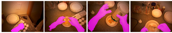
Figure 1: Hand detection of [1] used to harvest candidate regions.