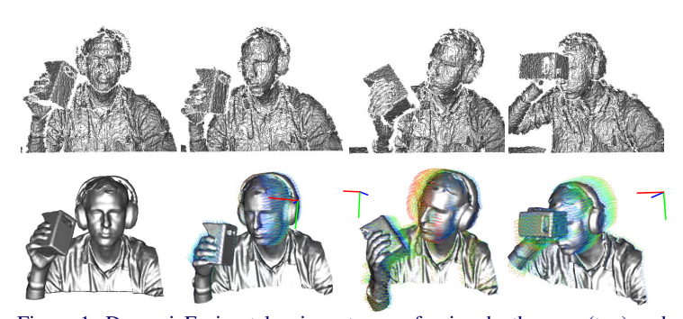
Figure 1: DynamicFusion takes in a stream of noisy depth maps (top) and outputs a dense reconstruction of the moving scene (bottom). Motion trails are shown for correspondences from the last 1 second of motion, with a coordinate frame showing the rigid body component of the scene motion.

Our main insight is that undoing the scene motion to enable fusion of all observations into a single fixed frame can be achieved efficiently by computing the inverse map alone. Under this transformation, each canonical point projects along a line of sight in the live camera frame (see Figure 2). Since the optimality arguments of [1] (developed for rigid scenes, and used in the KinectFusion algorithm) depend only on lines of sight, we can generalize their optimality results to the non-rigid case.