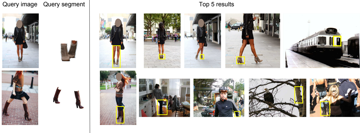
Figure 5: Top 5 returned images for two query instances. For the first instance, it has 5 relevant images in the search set, and 4 of them are returned in the top 5 positions. For the second instance, there is only 1 relevant example in the search set and it is returned at the first position. The irrelevant results are very similar visually to the query.

amples. Figure 5 shows the top 5 results of two query instances returned by the proposed method. On Oxford5k , the same method achieves the second best performance, 65.14. The best performance is obtained by combining category-specific attributes with deep features only. The building classifier does not help probably due to two reasons. One is that the building classifier is learned on cluttered images with skies and grasses and hence cannot well handle the problem of the deep features mentioned before. Had we had clean building images for training, the classifier would probably help improve the performance. Another reason is that a large portion of the images in Oxford5k are buildings and the classifier may push examples of irrelevant buildings to the top of the ranking list. The building classifier would probably be more useful in a larger dataset which contains many non-building examples. The fact that Oxford5k contains many building images also explains why category-specific attributes alone can already achieve quite good performance, 58.37. Overall, we conclude that the proposed method of combining the category-specific attributes with two types of category-level information is effective, outperforming the combination of category-level information with Fisher vector.