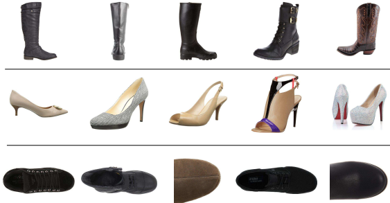
Figure 3: Three learned attributes. Each row is one attribute and the shoes are the ones that have high response for that attribute. Although the automatically learned attributes have no semantic meaning, apparently they capture sharing patterns among similar shoes. The first attribute represents boots. The second attribute describes the high heels and the third one captures the round toe.

In the second experiment, we compare the learned attributes with existing approaches evaluated in the previous section on CleanShoes , Cars and OxfordPure . Table 3 shows the results. The attribute representation works significantly better than the others on the shoe dataset and the car dataset. Attributes are superior in addressing the large appearance variations caused by the large imaging angle difference present in the shoe and car images, even though the attributes are learned from other instances. The