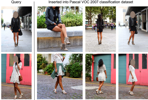
Figure 4: Examples of two shoes from StreetShoes . The left are the query images and the rest are inserted into Pascal VOC 2007 classification dataset [9] which provides distractor images. We only consider the shoe segment in the query example to ensure the target is clear.

the second fully connected layer of a CNN [22] as an additional feature, as it has been shown the activations of the top layers of a CNN capture high-level category-related information [47]. The CNN is trained using ImageNet categories. Second, we build a general category classifier to alleviate the potential problem of the deep learning feature, namely the deep learning feature may bring examples that have common elements with the query instance even if they are irrelevant, such as skins for shoes and skies for buildings. Combining the two types of category-level information with the category-specific attributes, the similarity between a query q and an example d in the search set is computed by