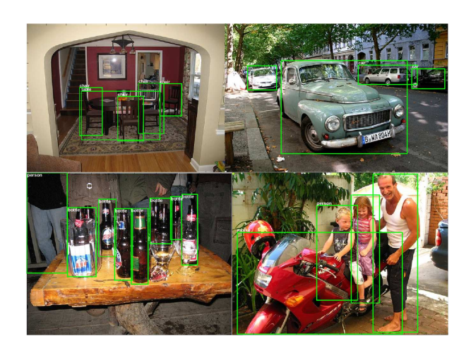
Figure 5. Example detections of CRAFT on PASCAL VOC 2007 test set.

PASCAL VOC. Therefore, we add additional some additional modules to the cascade proposal generator to further improve its performance.