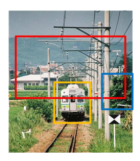
Figure 3. Example detections from a Fast-RCNN model. Different colors indicate different object categories. Specifically, orange color denotes "train", red denotes "boat" and blue denotes "potted plant".

those with similar appearance and/or belong to semantically related genres (car and bus, plant and tree). This calls for a feature representation that captures both the inter-category and intra-category variances. In the case of Fast R-CNN, the multi-class cross-entropy loss is responsible for helping the learned feature hierarchies capture inter-category variance, while it is weak at capturing intra-category variance as the "background" class usually occupies a large proportion of training samples. Example detection results of Fast R-CNN are shown in Figure 3, where the mis-classification error is a major problem in the final detections.