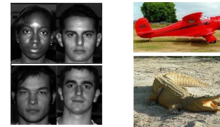
Table 2: Coding in Euclidean space. Left panel. Samples from extended YALE-B [4]. Middle panel. Samples from Caltech101 [3]. Right panel. Recognition accuracies.