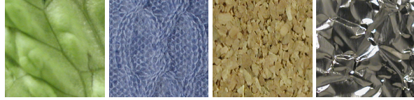
Figure 2: Samples from the KTH-TIPS2b material dataset [4].

We report the mean recognition accuracies over the 10 runs in Table 2. The NN results clearly show that the CovDs computed in RKHS are more discriminative than the ones built directly from the original features. Note that applying kernel SVM boosts the performance of all the CovDs. Note also that our simple NN scheme in RKHS achieves comparable performance to the more involved CDL. Our