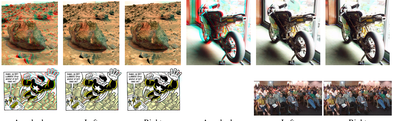
Anaglyph Left Right Anaglyph Left Right Figure 7. Examples of stereo pair reconstruction. We are able to handle object disocclusions and image boundaries to a certain extent. More examples can be found in the supplementary file.