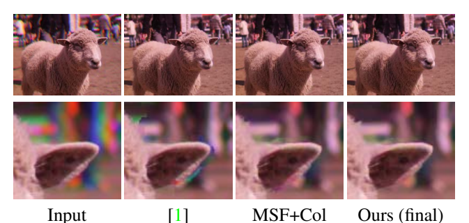
Input [1] MSF+Col Ours (final) Figure 6. Comparison with Bando et al. [1] on images taken with their camera. "MSF+Col" refers to using our ASIFT-Flow (rough matching) and colorization. The right column is the result of applying our full algorithm. Notice that the results of our technique have less apparent edge artifacts.

The computed PSNR values of our algorithm are shown in Table 1. We see that our method performs better than the baseline. Note that recolorizing occluded regions does