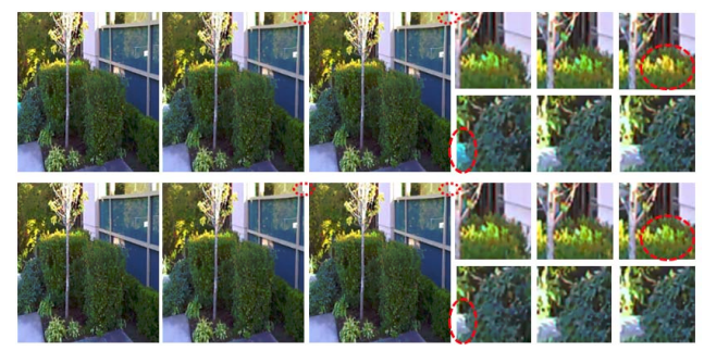
Figure 10. Results for an anaglyph video. Top row: three frames reconstructed independently. The highlighted areas (dotted ellipses) have inconsistent colors across time. Bottom row: results using temporal information. The colors are now more consistent. More examples are shown in the supplementary material.

Figure 10 shows results for an anaglyph video, which illustrate the importance of temporal information on preventing flickering effects caused by inconsistent colors across time. If the frames are processed independently, the resulting color inconsistencies tend to be local and minor, but noticeable.