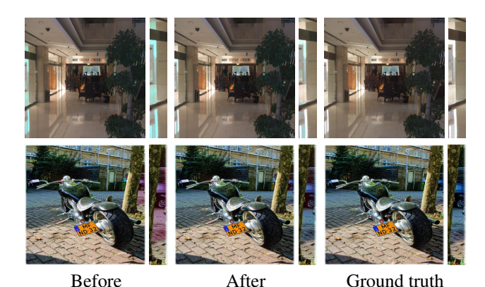
Before After Ground truth Figure 4. Examples of recolorization of occluded regions with incompatible colors.

Our approach uses the anchor colors to fill in the missing colors. However, objects in disoccluded regions may be incorrectly colored. As shown in Figure 4, for each scene, a border region of the leftmost image is unobserved in the other view, resulting in out-of-place colorization. To detect