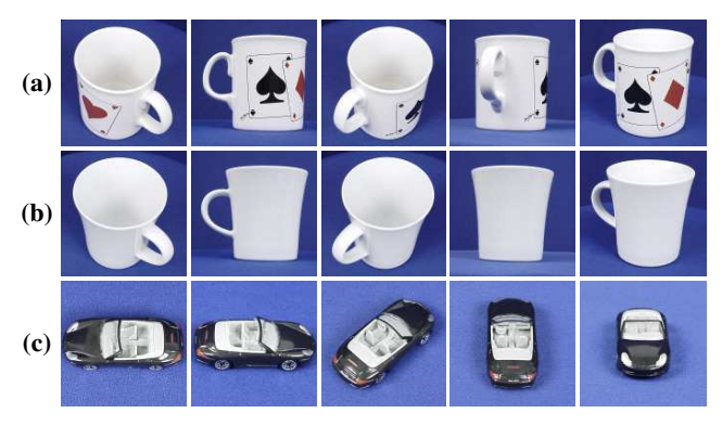
Figure 2. (a) Sample images of an extracted local linear subspace from a gallery image set. (b) Sample images of the constructed nearest subspace from a query image set of the same class. (c) Sample images of the constructed nearest subspace from a query image set of a different class.

Fig. 3 illustrates the results obtained on the ETH-80 dataset. In this test, all methods perform worse than on the Honda/UCSD dataset. ETH-80 is more challenging as it has much less images per set, significant appearance differences across subjects of the same class, and larger view angle variations within each image set. Nevertheless, the proposed SANS method dramatically outperforms other meth-